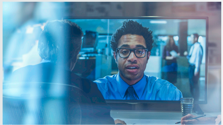
Best Practices for Communicating with Participants in Cisco WebEx Meetings ↗