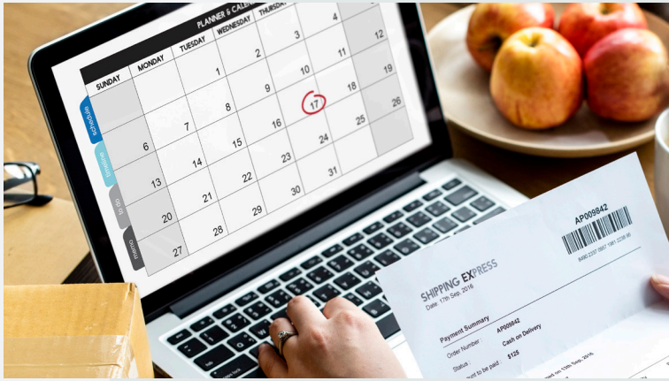
How to Schedule a WebEx Meeting ↗