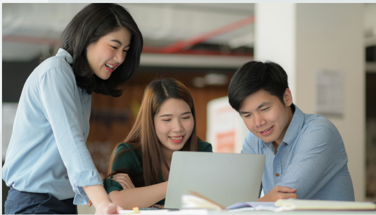
How to Attend a WebEx Meeting ↗ OR Watch This Short Tutorial ↗